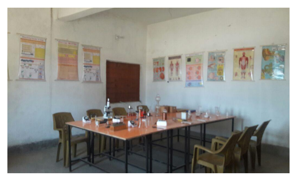
Science and Mathematical Lab.